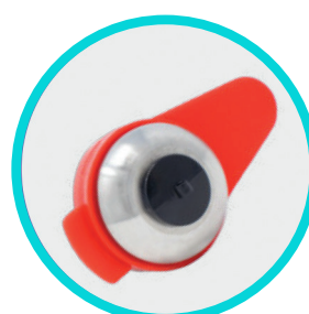
Suturehole for tissue fixation