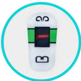
Visible indicator makes it easier for the operator to keep the triggering range between 1.5 mm — 2.5 mm