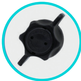
Tangible turning marks reduce the chance of a maloperation