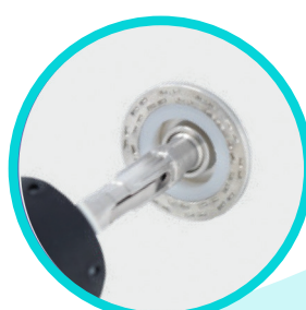
Unique hardened chopping ring provides precise cutting of tissue resulting in a loud clicking noise